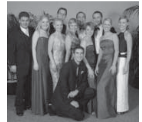
Above: Participants in the Mr and Ms All Queensland categories.