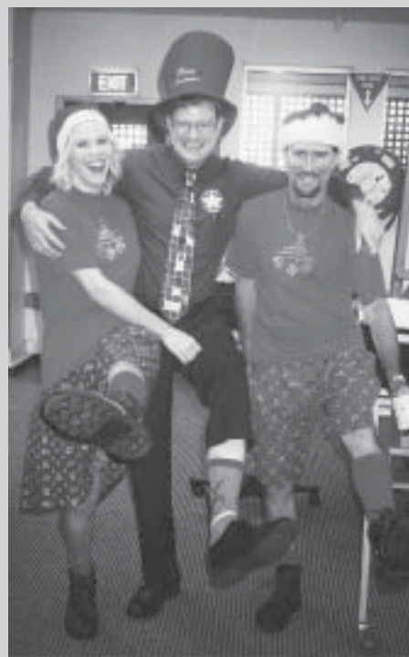
Above: Australia Post staff show their true Christmas colours